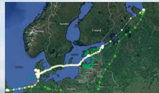
Figure 2. Tracks for three Bewick's Swans followed to the Russian arctic. The denser dots (GPS fixes) for BEWI11 (white dots) on crossing the Baltic Sea reflect an increase in recording GPS locations (from hourly to half-hourly) at this time. There is a gap in data for BEWI08 (turquoise dots) between leaving the Latvia/Lithuania border and arrival on the White Sea coast.

Additionally, another bird appeared to cross the footprints of one operational and four consented wind farms in the German North Sea, plus a further five at the application stage.