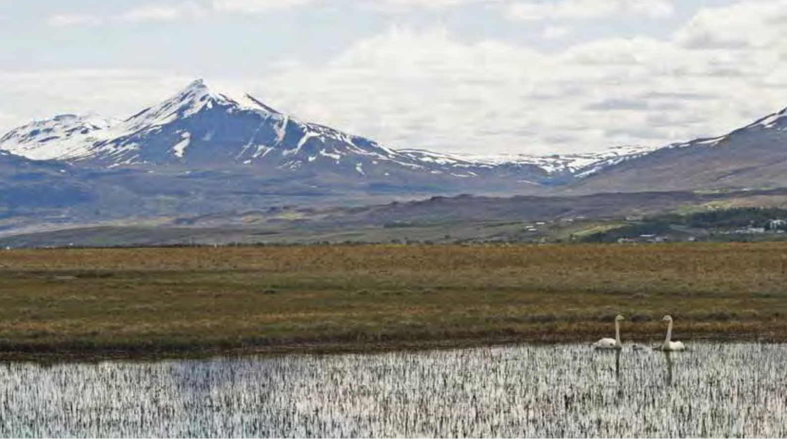
Whooper Swans with newly hatched cygnets in Iceland in early June 2014.