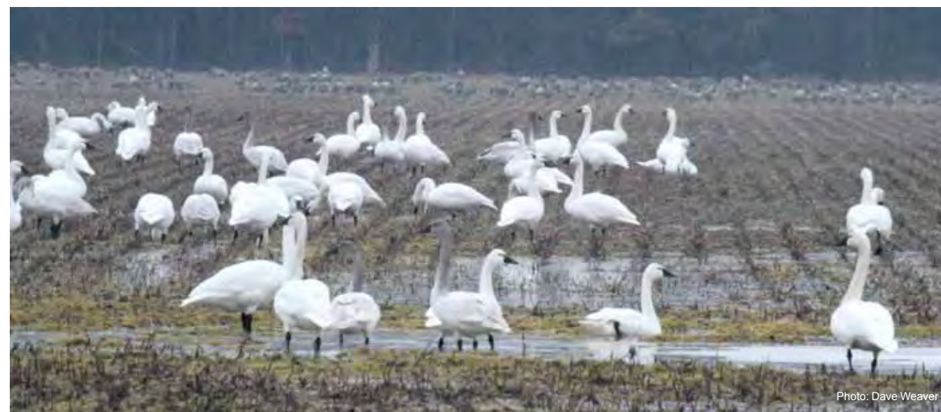
Tundra Swans feeding in stubble fields during the field excursion to Chesapeake Bay.