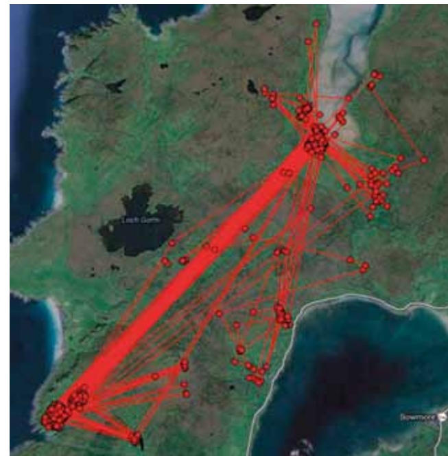
Figure 5. Winter location data for one of the Greenland White-fronted Geese marked at Gruinart, Islay in November 2013.

In addition, observations were made on the response of Greenland White-fronted Geese to the lethal and non-lethal scaring of Greenland Barnacle Geese carried out on Islay as part of the Islay Local Goose Management Scheme. The behavioural information gathered will also inform a distribution model and this will be examined specifically to see if there is evidence for localised under-use of otherwise suitable habitats in response to the scaring. Further updates on this project will be provided in future editions of GooseNews .