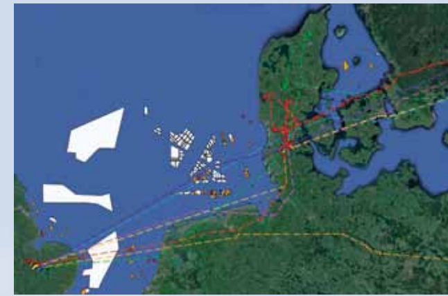
Figure 1. Bewick's Swan tracks in relation to offshore wind farm sites (white = proposed; orange = consented; red = operational).

The swans tracked in spring 2014 migrated by both day and night, with most birds leaving on south-westerly tail winds on 9/10 February and 21/22 February 2014. Data loggers for five of the swans provided information on their route crossing the North Sea, and extrapolated tracks suggested that four of these birds crossed the proposed offshore East Anglia wind farm footprint ( Figure 1 ). The precise tracks recorded for one bird probably passed over not only the East Anglia wind farm zone but also two consented offshore wind farms in Dutch waters.